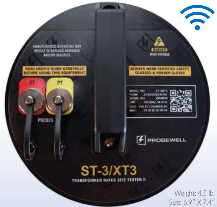
Weight: 4.5 lb. Size: 6.9" X 7.4"