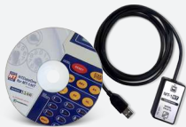
NTData One software and USB device